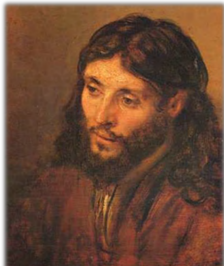
Head of Christ, Rembrandt von Rijn

'I have made your name known to those whom you gave me from the world. They were yours, and you gave them to me, and they have kept your word. Now they know that everything you have given me is from you; for the words that you gave to me I have given to them, and they have received them and know in truth that I came from you; and they have believed that you sent me. I am asking on their behalf; I am not asking on behalf of the world, but on behalf of those whom you gave me, because they are yours. All mine are yours and yours are mine; and I have been glorified in them. And now I am no longer in the world, but they are in the world, and I am coming to you. Holy Father, protect them in your name that you have given me, so that they may be one, as we are one. While I was with them, I protected them in your name that you have